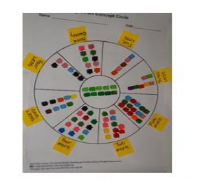
Number Quantities (more/less)