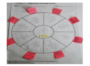
Translations & Transformations of Functions